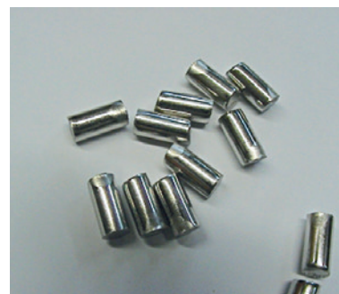
Pt ø 6 x 12 mm slugs

For alloys, which are not listed here, please contact us.