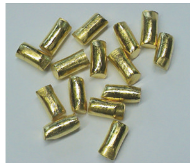
Au 5N ø 6 x 12 mm slugs