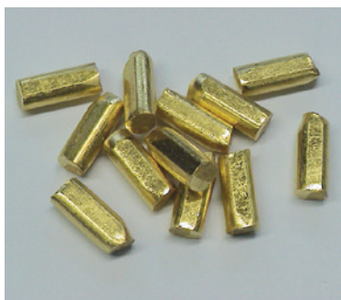
AuAs 0,4 % ø 5 x 11,1 mm slugs