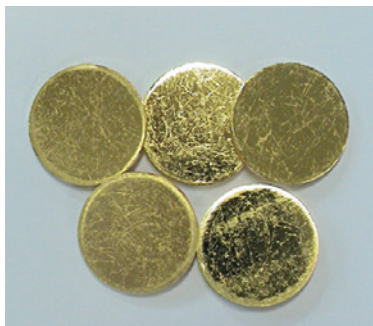
Au 5N ø 20 x 1,5 mm discs