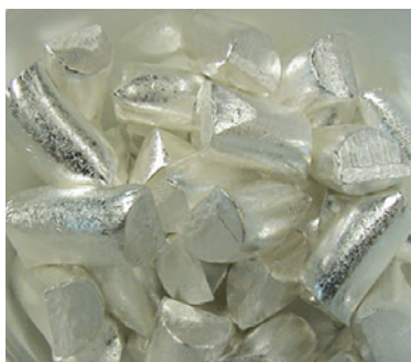
Ag 5N ø 13,5 x 25 mm slugs